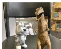
Full Shot/Eye Level

In Performing Arts students have been learning about camera angles and the different shots that are used for different purposes. Here are some examples of the camera angles they have learnt.