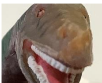
Extreme Close Up