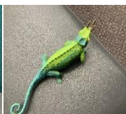
Birds Eye View